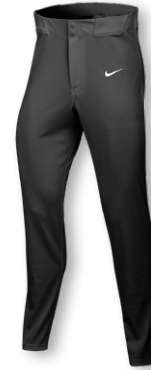
NIKE STOCK VAPOR SELECT2 PANT DX9154 Page 20