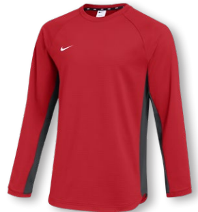
NEW NIKE STOCK LS PRE-GAME TOP HQ5878 Page 23