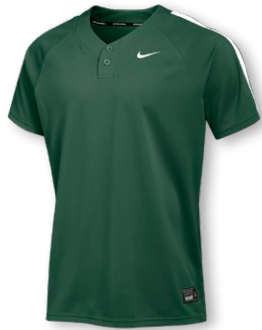
NIKE STOCK VAPOR SELECT2 2 BUTTON JERSEY DX9156 Page 18