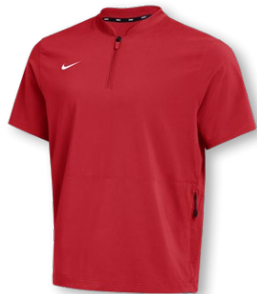
NEW NIKE STOCK SS WINDSHIRT HQ5843 Page 24