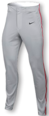
NIKE STOCK VAPOR SELECT2 PIPED PANT DX9155 Page 21