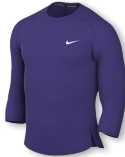
NIKE STOCK DF 3QT TOP D09173 Page 25