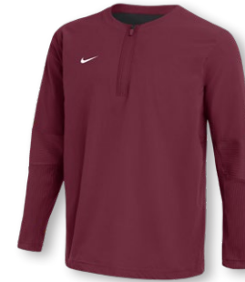
NEW NIKE DF LIGHTWEIGHT PLAYER PO HQ5959 Page 23