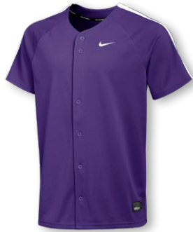
NIKE STOCK VAPOR SELECT2 FB JERSEY DX9147 Page 17