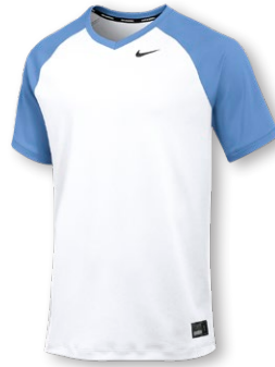
NIKE STOCK VAPOR SELECT2 V-NECK JERSEY DX9140 Page 19