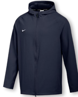
NIKE STOCK THERMA-FIT PRE-GAME JACKET FV8177 Page 22