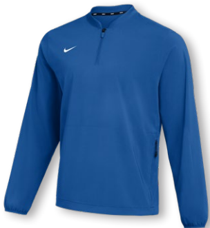
NEW NIKE STOCK LS WINDSHIRT HQ5842 Page 24