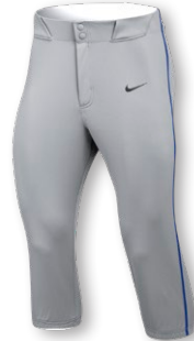
NIKE STOCK VAPOR SELECT2 HIGH PIPED PANT DX9139 Page 21