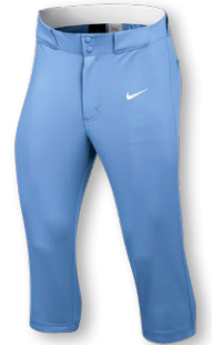
NIKE STOCK VAPOR SELECT2 HIGH PANT DX9152 Page 20